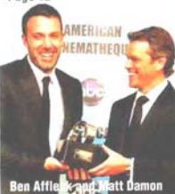
Ben Affleck and Matt Damon

Friends let loose at Matt Damon's American Cinematheque tribute. Page 12